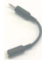
Scanner PC/IF Connector